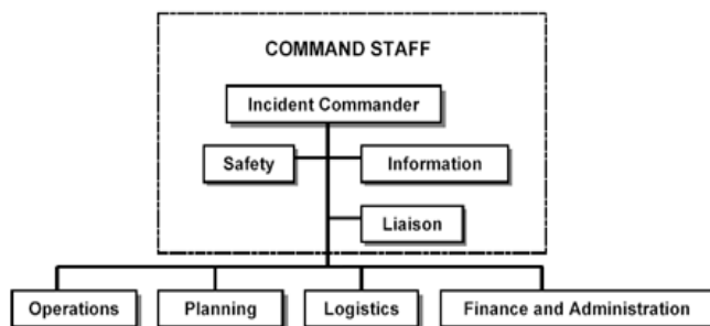
Figure 1 — Incident Command System Structure